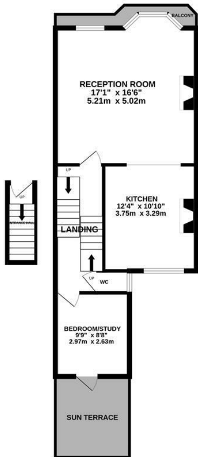
FIRST FLOOR 593 sq.ft. (55.1 sq.m.) approx.